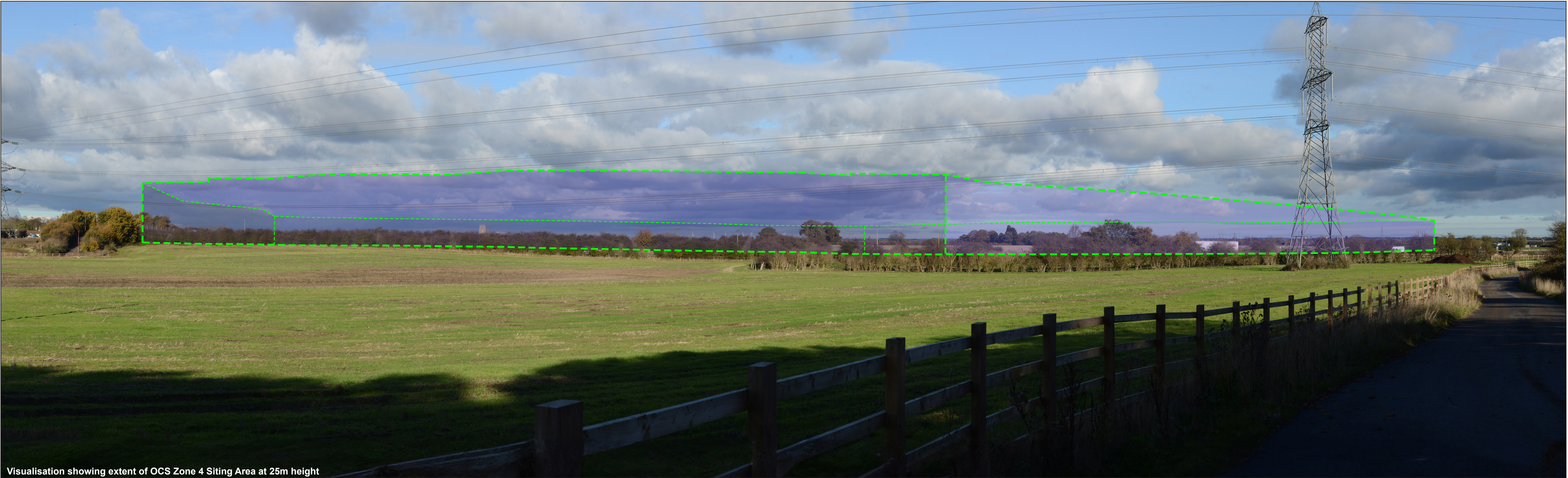
Visualisation showing extent of OCS Zone 4 Siting Area at 25m height